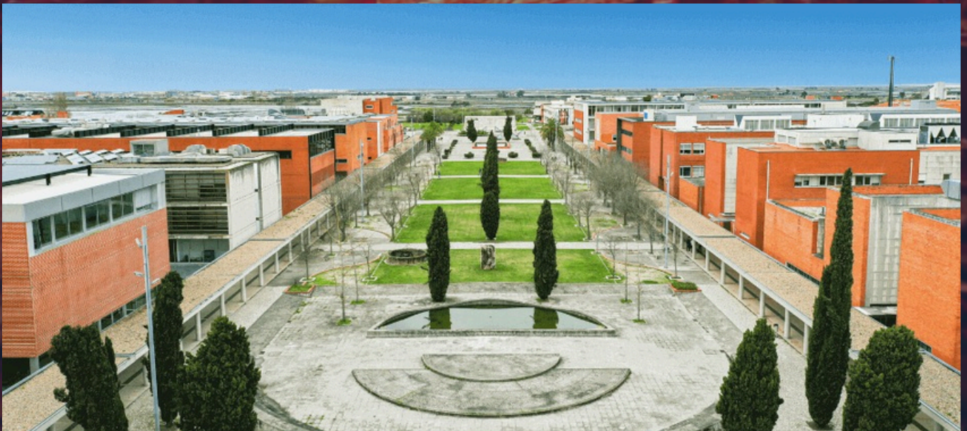
Universidade de Aveiro

Almost synonymous with the city itself is the University of Aveiro. Founded in 1973, beginning mostly with engineering courses, it quickly became one of the most dynamic and innovative universities in Portugal. Some of its buildings were designed by famous Portuguese architects.