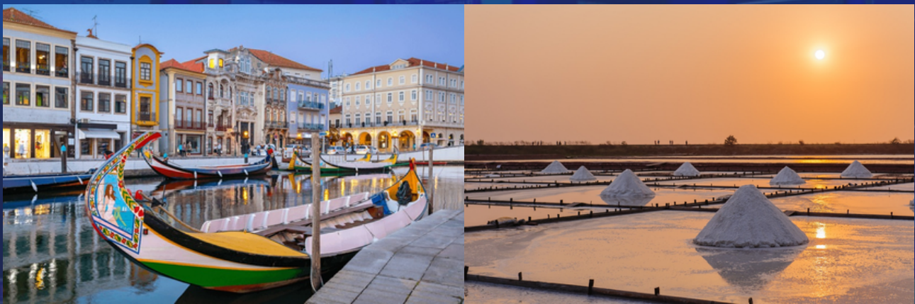
Left: Moliceiros. Right: Salinas.

Also known as the Portuguese Venice, the city of Aveiro is full of canals, bridges, and painted boats called “moliceiros”. These boats were used to remove the excess vegetation in the canals and to carry animals and goods. Nowadays they are a picturesque way to go sightseeing. Due to its proximity to the sea, Aveiro has relied on economic activities related to it, such as salt production. Many salt beds are now used for fish farming.