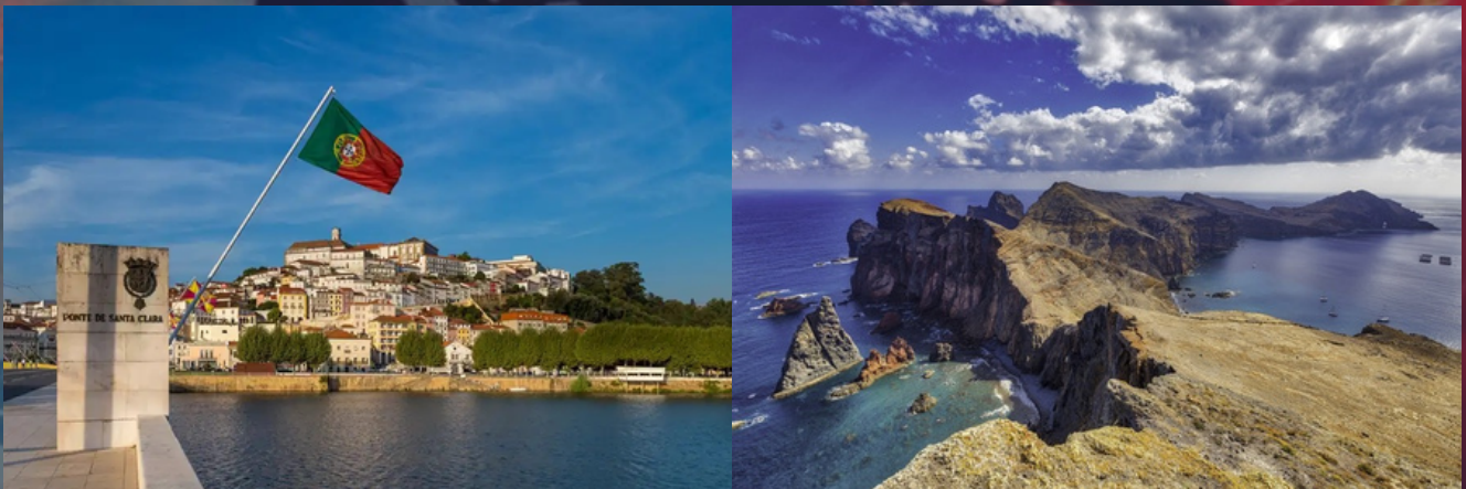
Left: Portuguese Flag. Right: Madeira Island.

Portugal is a nation in south-western Europe, in the west of the Iberian Peninsula. To the north and east, it is bordered by Spain and to the south and west by the Atlantic Ocean. The Azores (Açores) and the Madeira islands, both located in this ocean, are the autonomous regions of Portugal. The Portuguese population is around 10.3 million people and the capital of Portugal is Lisbon. Its other important cities are Porto, Coimbra, Braga, Aveiro, Faro, Funchal, and Ponta Delgada.