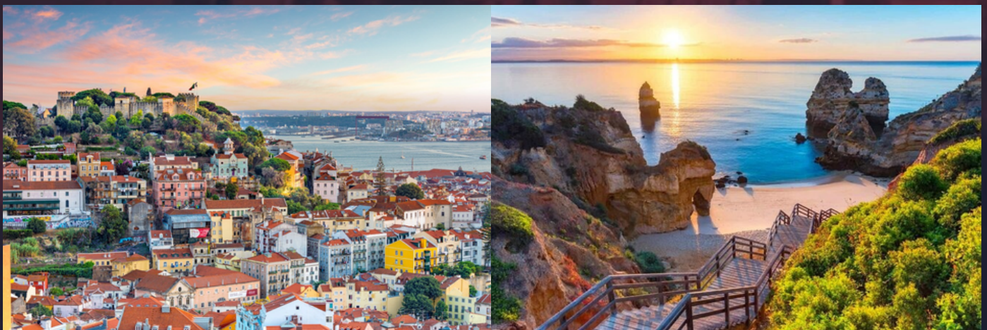
Left: Lisbon. Right: Faro.

Speaking of which, who doesn't like to eat?! In Portugal, you get to enjoy some incredible dishes. At the heart of many of them is codfish ("bacalhau"). To enrich the experience of a traditional Portuguese meal you have our prime quality olive oil, several unique cheeses.